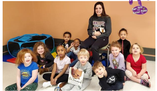
"Be Kind to All"