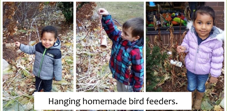
Hanging homemade bird feeders.

Santa has gotten creative this year, as we all have. South Metro Fire will be having Santa ride around the area on an old fire truck. It's called “Public Safety Holiday Roll Out Parade” and it will be on Thursday, December 3 rd at 5:30 p.m. There will be a parade route published that we will share as soon as it is completed. This will be a fun & safe way to see Santa this year if you live in the area!