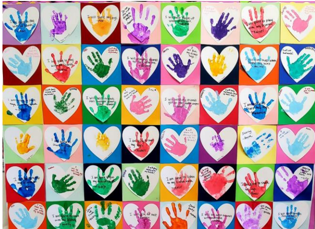
Our KINDNESS QUILT displayed in our entry way.

We are closed on Monday, July 5 th in observance of Independence Day. Reminder... there is no deduction in tuition for holidays. Please let us know if your child(ren) will not be attending any other days this week.