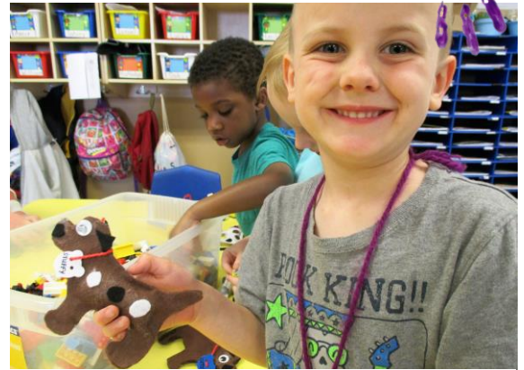
Red Group made their own stuffed dogs we are using for empathy lessons.