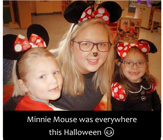
Minnie Mouse was everywhere this Halloween 😊