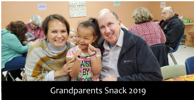
Grandparents Snack 2019