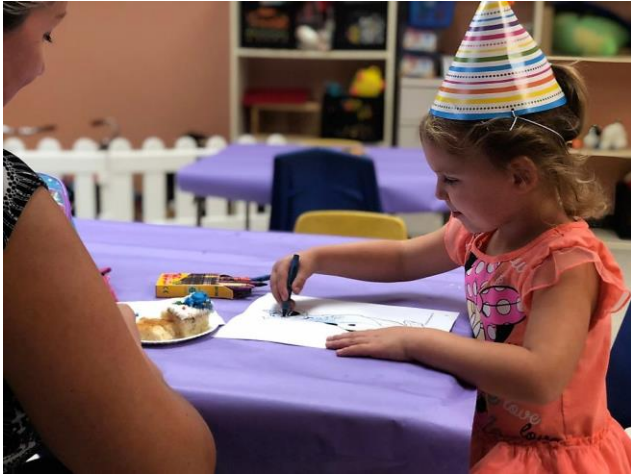
SCOOBY DOO PARTY